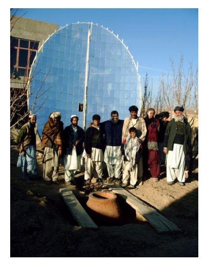
Figure 3: Scheffler cooker.

The most powerful solar cooker is composed of a paraboloid reflector and a bracket to hold a pot. The reflector bends the rays of light so that they are concentrated at a focal point under the pot, making it very hot indeed. The focal point is so hot that this kind of solar cooker can fry food, unlike the other types of solar cooker. These cookers work like the burner on an LPG stove. Dr. Dieter Seifert developed a series of very efficient cookers of this type that are now in use around the world. Wolfgang Scheffler designed an 11-square meter reflector that concentrates intense solar energy onto an area about 30 centimeters in diameter. It is used for solar cooking on an institutional scale. (Figure 3)