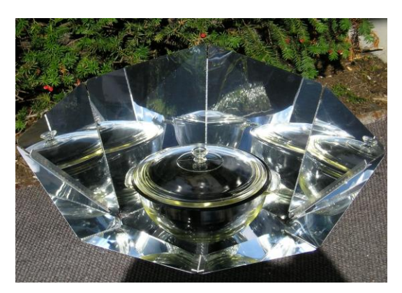
Figure 4: HotPot panel cooker.

The third and most recent design is the panel cooker. Its major features are low cost and increased portability, as the panels are hinged and can be folded up. Invented by Dr. Roger Bernard, it was initially adapted by Solar Cookers International for use in refugee camps, A commercial model developed by Solar Household Energy, Inc. is now available. In this model, called the HotPot, a black steel cooking pot with a wide flange is suspended inside a transparent glass bowl with a space of 1.3cm between the two. This assembly is covered with a glass lid and placed in front of a foldable reflector designed to deliver solar energy through the glass bowl to the black pot. The resultant heat is retained between bowl and pot by the pot's flange (Figure 4).