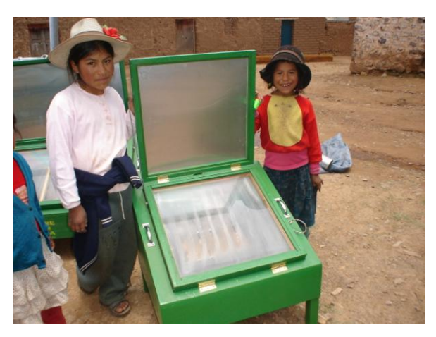
Figure 2: Box oven, Bolivia.

Not by the people who need them the most – virtually nothing is. However, there are now durable, efficient modern designs which can retail for $50 or less. There are continuing efforts to reduce that cost further. Creative financing will always be necessary to achieve the widest possible distribution. This includes micro banking, lay away plans, barter arrangements and subsidies. And since solar energy is free, people eventually pay for their ovens with the money they have saved by reducing their need for traditional fuels.